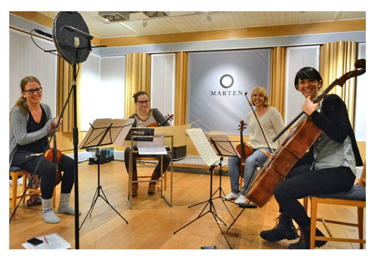
Sjöströmska kvartetten at the Marten state-of-the-art studio designed by SMT